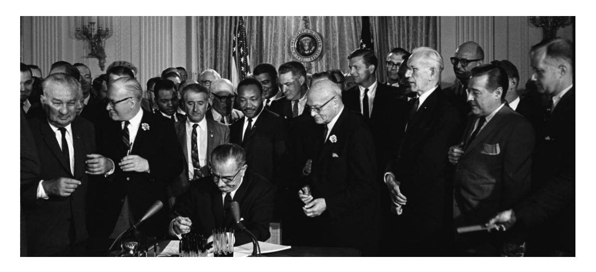
President Johnson Signing the Civil Rights Act of 1964

FEDERAL COORDINATION AND COMPLIANCE SECTION CIVIL RIGHTS DIVISION U.S. DEPARTMENT OF JUSTICE SEPTEMBER 2011